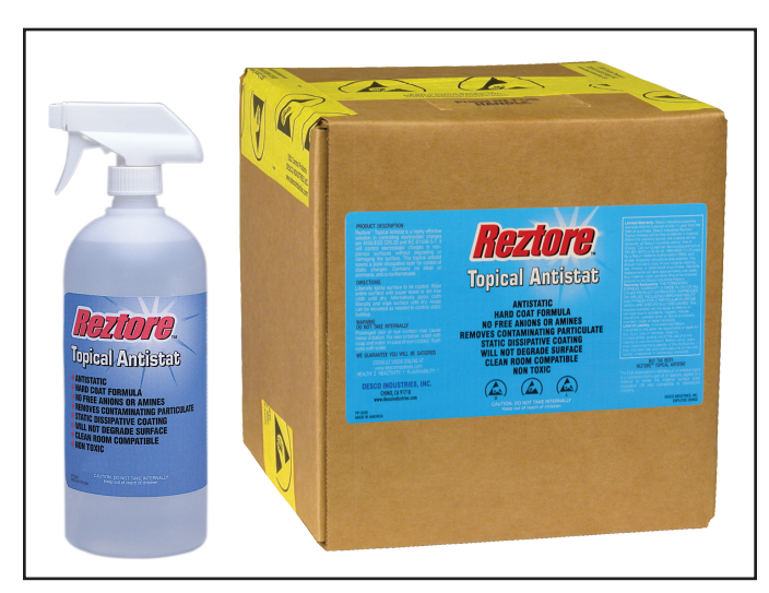
Figure 1. Reztore™ Topical Antistat 1 Quart (1 liter) Spray Bottle 2.5 Gallons (10 liters) Bag-in-Box