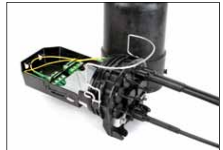
3M™ Fiber Dome Stubbed Terminal FDST 08 with the 3M™ External Cable Assembly Module (ECAM) FD Factory Terminated Fiber Drop

For factory-terminated drop terminations, the FDST 08 terminal utilizes the 3M™ External Cable Assembly Module (ECAM) FD Factory-Terminated Fiber Drop Cable. The 3M ECAM FD module is a factory-terminated drop cable with SC connectors on one or both ends. It is available with SC/APC or SC/UPC connectors and in lengths ranging from 50 to 2,500 feet (15 to 760 m). The innovative design of the ECAM FD drop cable allows the SC connector to be replaced with a field assembled connector thus allowing the drop cable to be salvaged if the SC connector is damaged. The ECAM FD module is shipped with a pulling sock to protect the drop and to allow the drop to be pulled through trees and conduit.