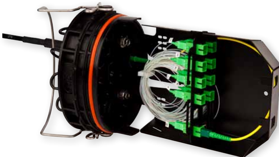
3M™ Fiber Dome Stubbed Terminal FDST 08 with 3M™ PLC Splitter