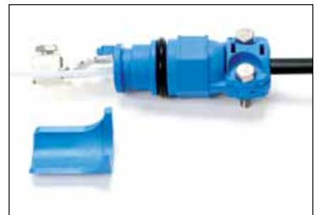
3M™ 12 mm External Cable Assembly Module (ECAM) Cable Entry Port