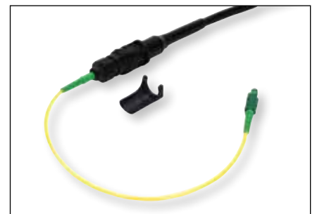
3M™ External Cable Assembly Module (ECAM) FD Factory Terminated Fiber Drop